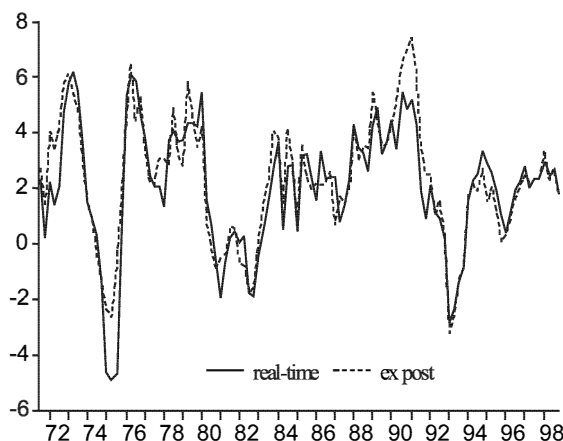
Figure 1: Initial and ex post data on real output growth. Change from previous year in %, quarterly data

a downward bias in the initial estimates. The measurement error is also quite persistent. Overall, both problems are much less due to revisions of actual output data than to persistent downward revisions of the Bundesbank's estimates of potential output. The latter reflect the fundamental difficulty inherent in correctly estimating the level of an economy's production potential, especially in the wake of adverse supply shocks like the ones encountered in the 1970s.